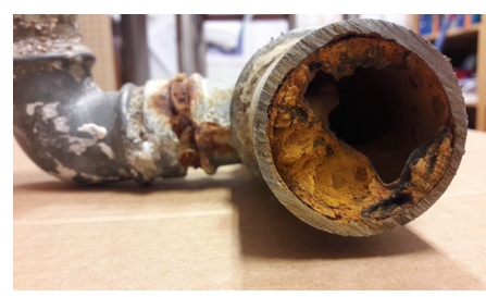
Water pipelines that are more than 50 years old can close up almost entirely, weakening water quality.

The boundary for liability for the water pipeline network between the property and the water utility lies in the water mains or at the water service valve. The liability boundary for wastewater and storm water is at the main sewer or connection manhole. Backflow valves or pumping stations in basement spaces are also the property's responsibility. If sewage floods into the spaces below backflow prevention height, the property is solely responsible for the damage caused by the flood.